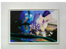
Mamie Tinkler Daybreak, 2023 Watercolor and gouache on paper mounted to dibond 20 x 30 inches (50.80 x 76.20 cm) 21 3/4 x 31 3/4 inches (55.25 x 80.65 cm) (framed)