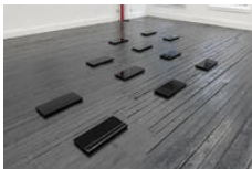
H.A. Halpert Not Ceasing to be Agitated by Earthquakes, 2023 steel, paint, water, reflections 20 1/2 x 9 1/2 inches (52.07 x 24.13 cm)