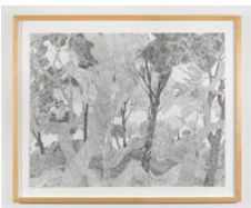
C'naan Hamburger Woozy, 2024 pen on paper 22 7/8 x 27.9375 inches (58.10 x 70.96 cm) (framed)