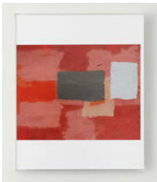
John Lehr Painted Wall, 2021 Pigmented inkjet print 24 1/2 x 20 1/2 inches (62.23 x 52.07 cm) Edition 1/2 + I AP