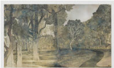
C'naan Hamburger Manhattan as an Olmsted Park, 2024 Steel and enamel 21.85 x 36 inches (55.50 x 91.44 cm)