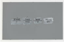
Luke Stettner I UNDERSTAND / YOU UNDERTAKE / TO UNDERMINE / MY UNDERTAKING, 2024

Graphite and wax pastel on Dura-lar 25 x 40 inches (63.50 x 101.60 cm)