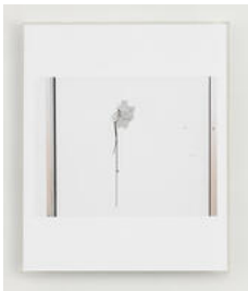
John Lehr Ziptie, 2021 Pigmented inkjet print 24 1/2 x 20 1/2 inches (62.23 x 52.07 cm) Edition 1/2 + I AP